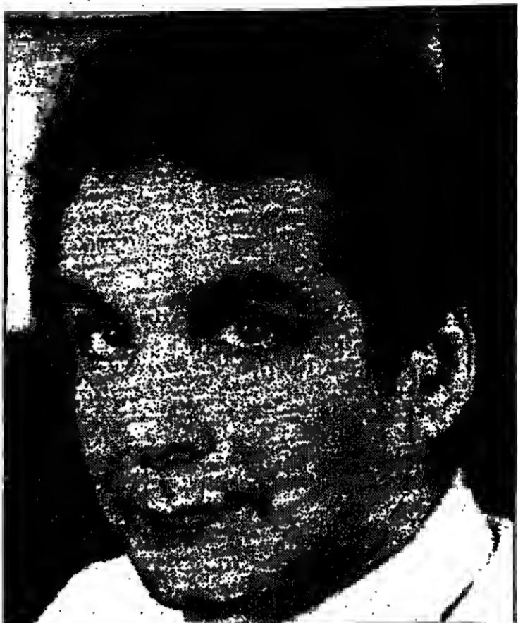
Krauthammer 'has been to the future, and it works.'

Secretary of State Warren Christopher culpable for leading what he calls a "hopelessly misguided" foreign policy meant to draw Syrian President Hafez Assad into reacting a peace treaty with Israel. There is Assad. In a Washington Post column last June, Krauthammer penned a fictional letter from President Clinton to Assad that opened: "Dear Hafez: You sonofabitch." Within days, a letter to the editor criticized the paper for permitting a key Arab leader to be mocked in this manner. The author, however, is unrepentant. "Sonofabitch is actually a mild term to describe a world-class thug and butcher," Krauthammer says now. "Even if it had not been a satiric column, even if I had meant it seriously, it would have been perfectly appropriate... I think it's absolutely disgraceful how we sugar-coat the real nature of some of the thugs on the planet." Having said that, Krauthammer might still have excused the US approach. "I am not against immoral foreign policies if they